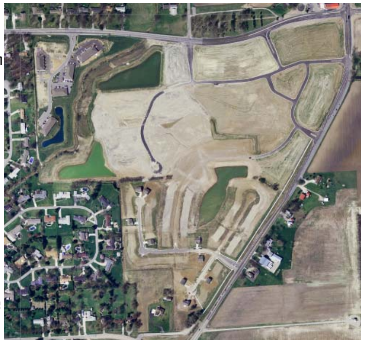
Stellhorn and Brickshire-Offices, Commercial, Retail, and Residential