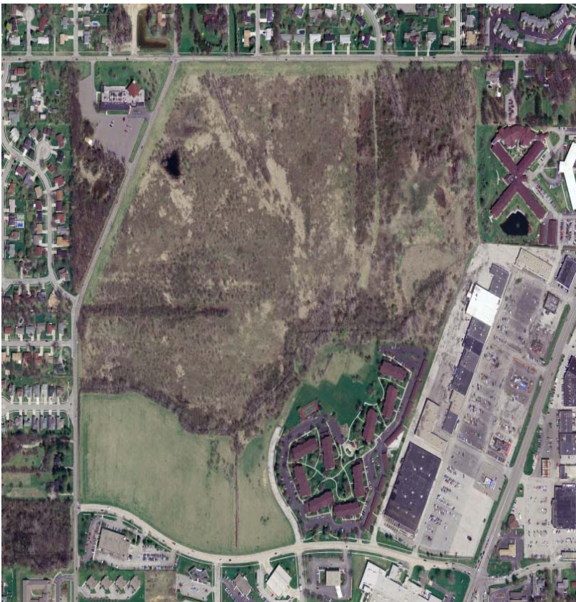
Cumberland Crossing Loop Trail Aerial Photograph