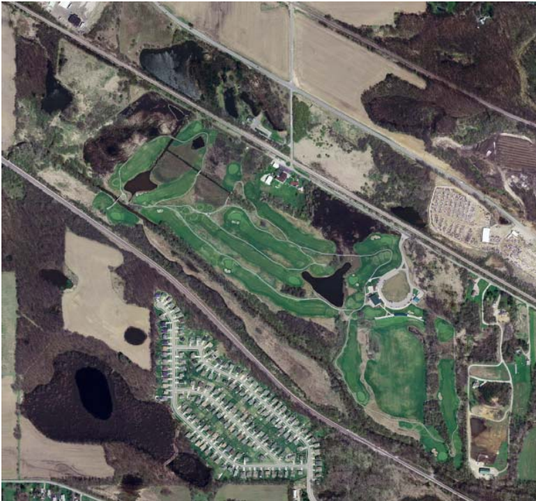
Creekside Golf Course Aerial Photograph